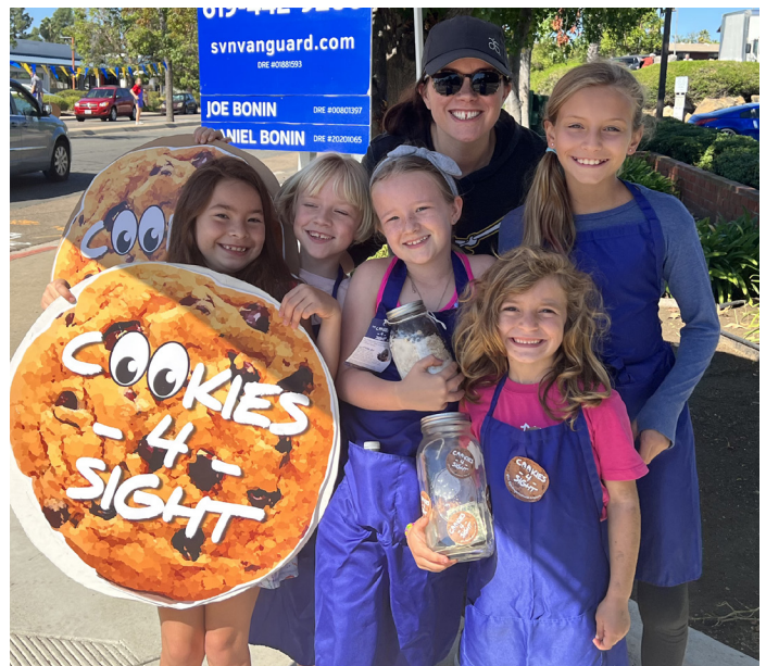
Group of girls wearing blue aprons holding Cookies-4-Sight jars and signs, shaped like a chocolate chip cookie.