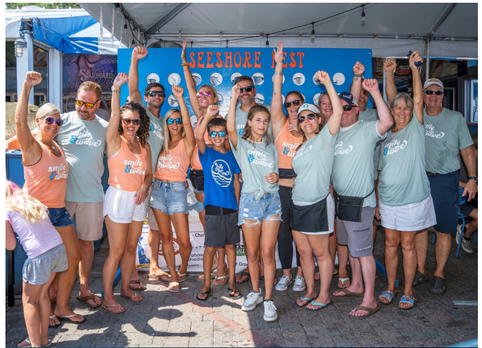
SeeShore Fest participants punching their arms in the air wearing their 'Smile & Wave' t-shirts.

The 2022 SeeShore Fest, which was its seventh annual, took place on August 27, 2022, and with over 1,000 attendees throughout the day, they raised over $26,000, putting the fundraiser total since inception over $109,000.