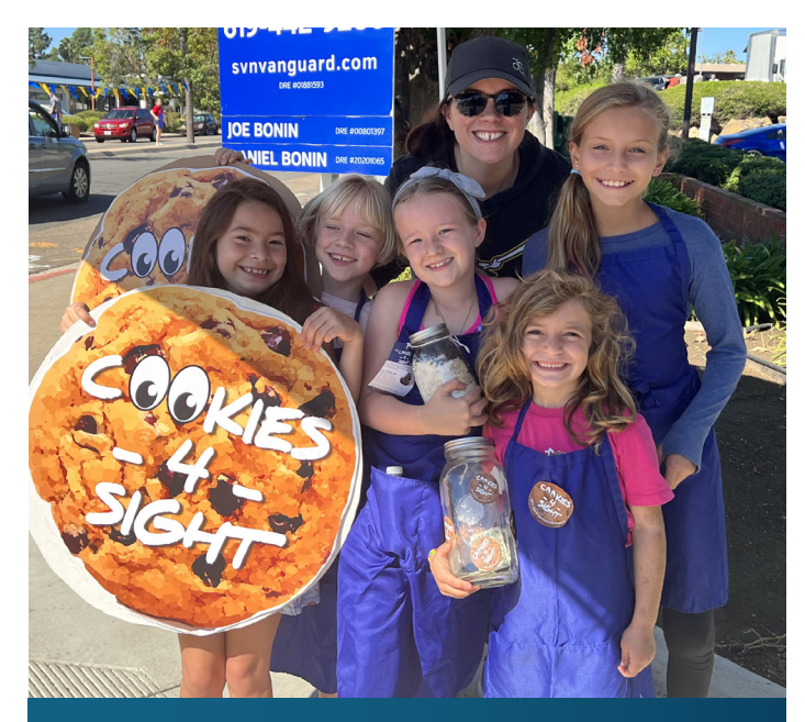
Group of girls wearing blue aprons holding Cookies-4-Sight jars and signs, shaped like a chocolate chip cookie.